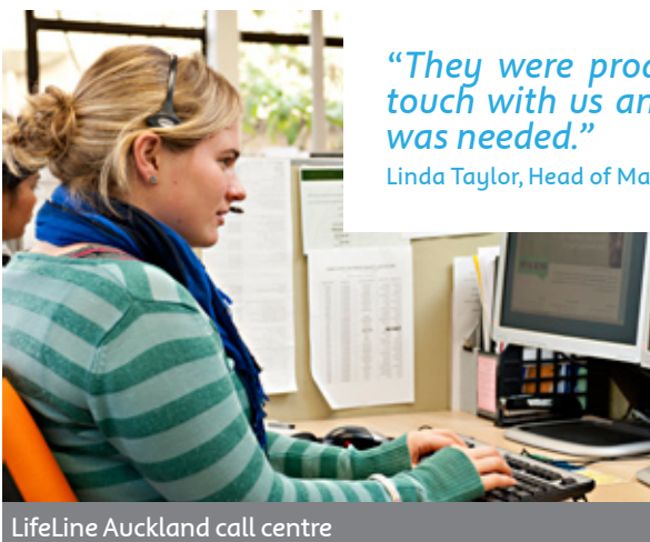
LifeLine Auckland call centre