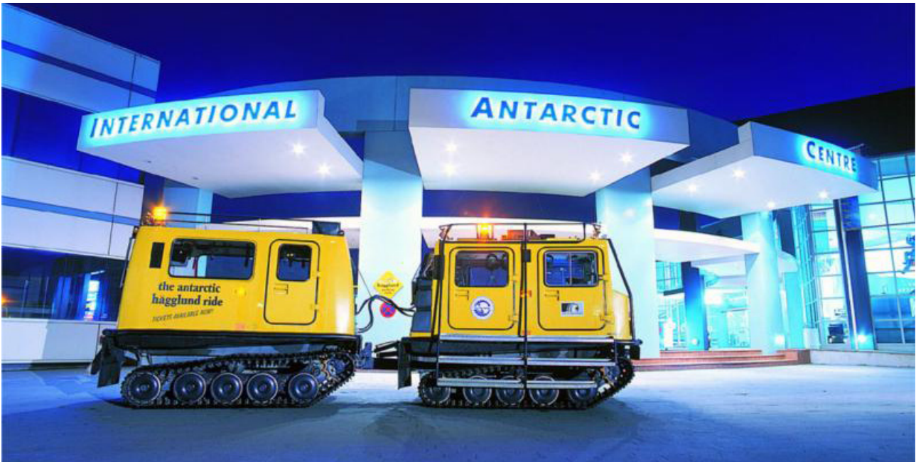
Antarctic Centre, where Grant Thornton's offices had to be relocated to