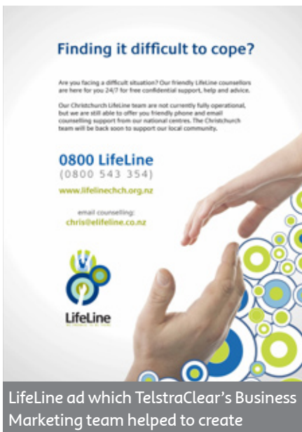
LifeLine ad which TelstraClear's Business Marketing team helped to create

TelstraClear even went the extra mile, helping out when LifeLine was given free advertising space in the Christchurch Press. TelstraClear assisted with the writing and design of an advertisement to promote the fact that their phone counselling and support services were still operational, despite their Christchurch call centre being out of action. The Business Marketing team worked with LifeLine Christchurch to produce the ad from start to finish, including design, in just a couple of days.