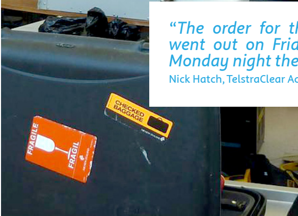
The IT team had to re-establish the server room after having an hour to remove everything from Victoria Street.