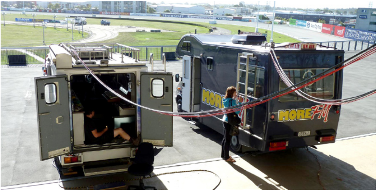
Outside broadcasting vans 'on air' at Addington Raceway