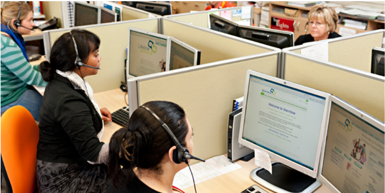
Calls from the Christchurch call centre were diverted to LifeLine Auckland